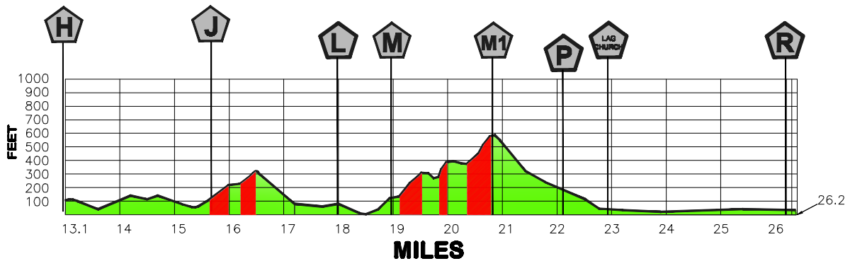
Stage 2 - MALIN MARATHON (Pier Rd. to Malin town ) Half Marathon Route